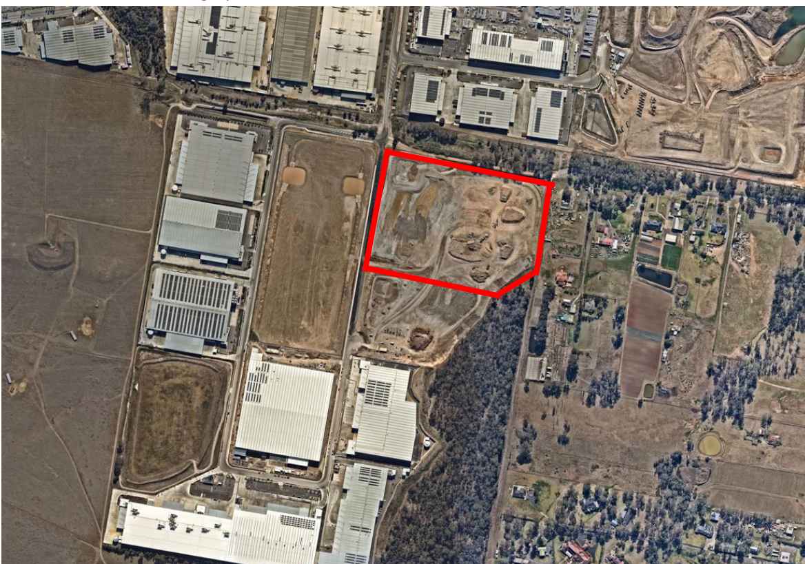
Plate 1 Site Aerial Photograph

The site is within a developing employment precinct, including the ESR Horsley Logistics Park, Oakdale Central, Oakdale South and Horsley Park Employment Precinct. It is also close to other established and emerging employment-generating precincts, including Eastern Creek to the north, Huntingwood to the north-east, Wetherill Park and Mamre Road West to the north-west and Wetherill Park to the east.